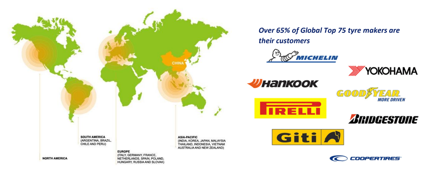
Serving over 1,000 customers globally, their market share in rubber accelerators is 20% globally and 33% in China