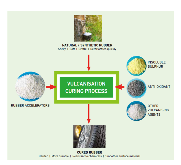
China Sunsine is a leading producer of specialty rubber chemicals used mainly in the curing of rubber in the tyre industry